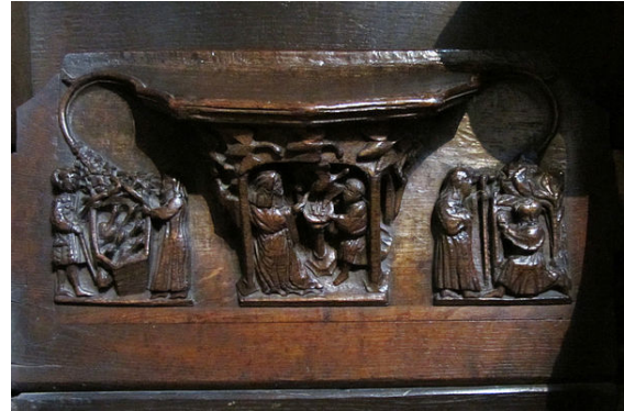
Miracles of St Werburgh, including the resurrection of the goose, depicted on a misericord at Chester Cathedral

By the year 708 her brother Cenred had succeeded as king of Mercia; he now decided to move his sister's body to a more conspicuous place within the church at Hanbury. Her body was found to be miraculously intact. This was